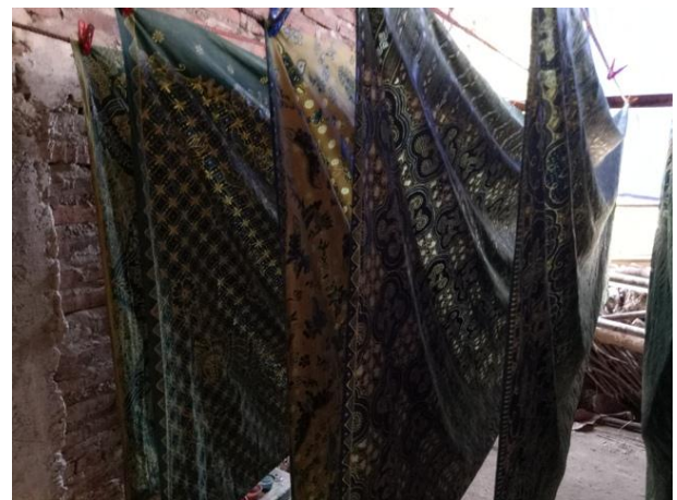
Figure 4. Airing Traditional Batik after Coloring

The skills of coloring Batik is definitely depending on the working experiences. The better the experience, the better Batik color is created. For natural color Batik, each fabric will have specific color. When using natural color, the first fabric submerged will have different color from the second fabric submerged to the same bucket. It is therefore natural coloring is hardly fulfilling business order with huge quotas. As an art product, uniqueness and rarity is the value of Batik natural color. The level of uniqueness of products and the level of complexity in the making makes Batik natural color is somewhat expensive. However, if we see the efforts women Batik entrepreneurs were given to make Batik, we will no doubt happily pay the given price without any bargain.