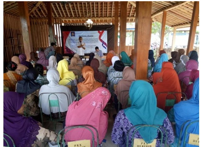
Figure 1. First Round FGD

problems among cluster members in Batik natural color productions. A more complete information were collected than the previous field survey. Other than sharing information through group discussions, the team also socialize on the importance of maintaining quality standard when competing on wider market. To sustain the competitiveness, Batik producers need to have quality standard. While sharing information and discussing the quality standard for natural color Batik, the team arranged the most suitable standard operating procedures (SOP), that in the future, all members of Banyuripan Batik cluster should stick with. This SOP should in the future be the guidance for maintaing quality standard as well as maintaing health and safety standard.