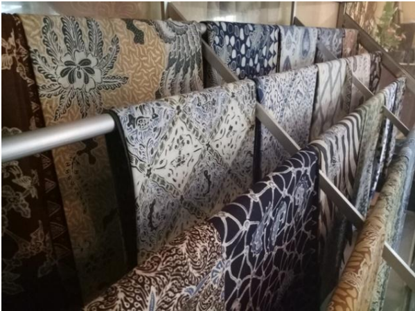
Figure 5. Hand Drawn Natural Color Batik – end products

table ready for drafting. After designed with some motifs then waxing the particular areas. The tool that is used to produce the hand drawn Batik is called the Canting. Canting is originally invented by the Javanese. Canting is a small copper container. Canting has different sizes of spouts, to create varied design effects.