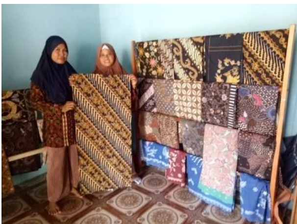
Figure 2. Women Batik Entrepreneurs - Banyuripan Cluster

When Islam came to Indonesia and led some areas in Java, Batik designs have significantly changes. Islamic belief prohibits showing human figures and animals. At the same time, certain traditional motifs were still preserved by the royal families. The majority of traditional Batik collections, the history and the meaning have been preserved by the royal families. After Islam gave big influences for Javanese culture, then western culture started invading Indonesia. This is the time when Batik was started to be introduced outside Indonesia. The designs and the rules of making Batik were no longer as strict as the traditional rules. There were more freedoms in designing Batik and even the general public can enjoy using the royal Batik design.