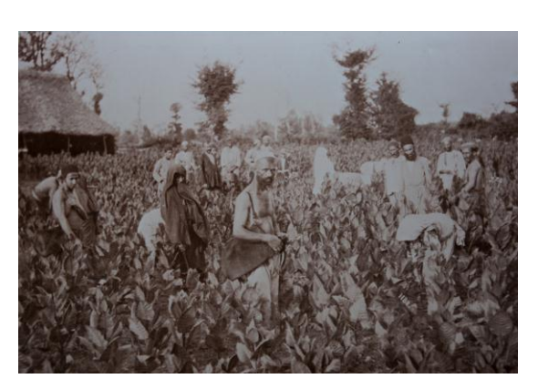
Figure 4. Tobacco farm in Gilan, 1892 Antoine Surveguin