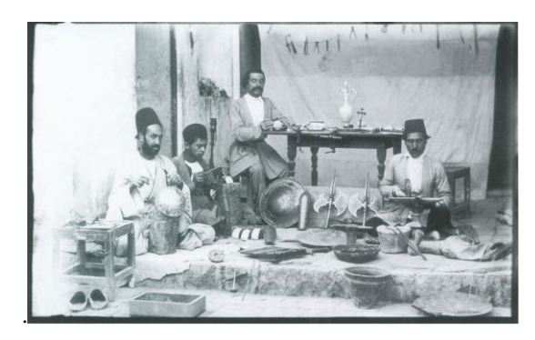
Figure 5. Copper market, Ernest Hoeltzer, the late nineteenth century

sensitivity of glass, his work was hindered. He has expressed his sadness for not being able to photograph weavers in dark workshops (ibid, 24).No doubt, Hoeltzer's documentation provide scholars and enthusiasts with detailed information about Iran in the nineteenth Century. (Figures 5, 6)