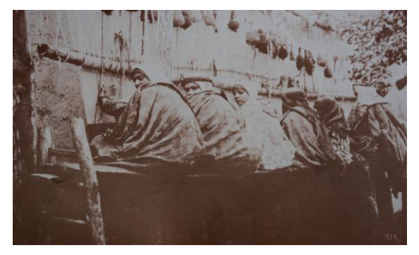
Figure 3. Girls weaving rugs, Servuguin, 1892