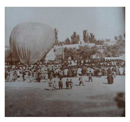
Figure 8. Flying ballon in Tabriz's Mashgh square- Mirza Ebrahim, 1893

Photography of some sport events and competitions held in town squares, such as wrestling and horse races, are another category. The album number 437 in Golastan palace which contains the photos taken in 1895 and 1896 show Naseredinshah's funeral from different angles. Such photos can clearly and perfectly show the reality of events in over a hundred years ago.