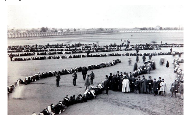
Figure 2. The women gathered in Mashgh square for some continuous days and were given tips, 1892

Photography of professions is mostly related to small workshops, laborers, carpenters, pharmacists, dancers and so on as well as official jobs such as the employees of telegraph company and gas lamp factory. Most of the jobs have disappeared today. That is why these photos are historically very important.