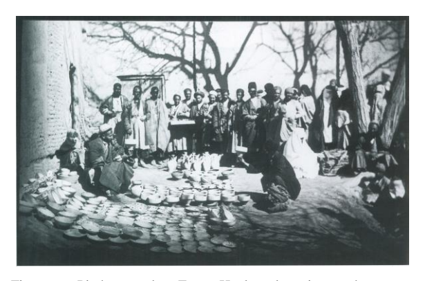
Figure 6. Pitchers market -Ernest Hoeltzer-late nineteenth century.